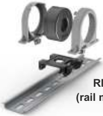
RMS-CT-25 (rail mounting kit)